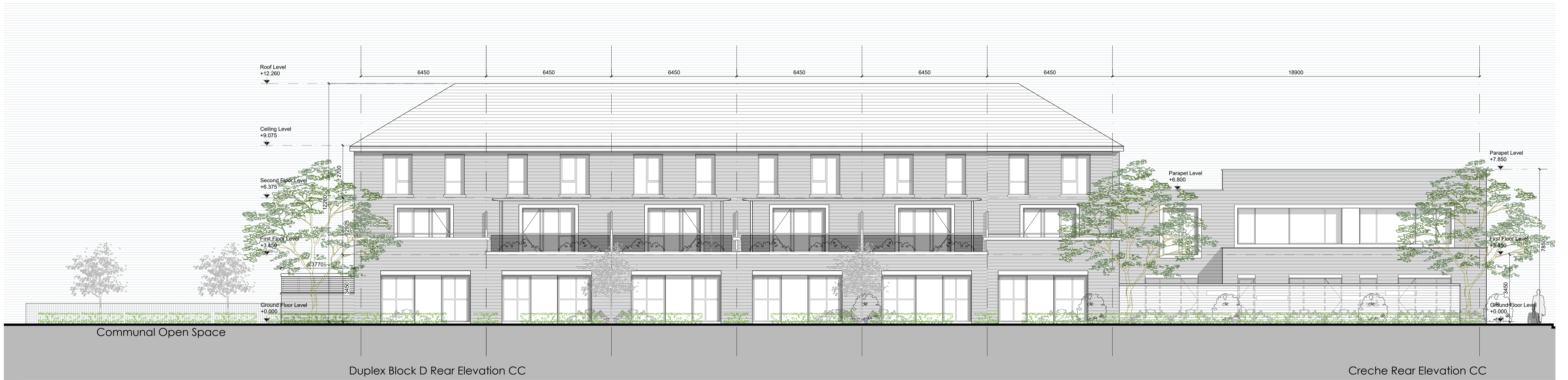
Duplex Block D Rear Elevation CC