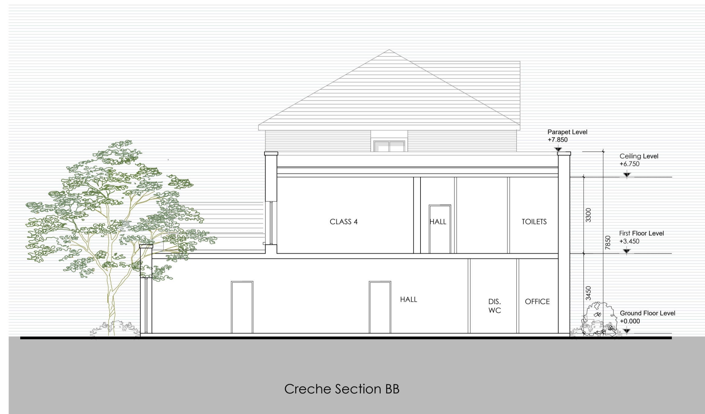
Creche Section BB